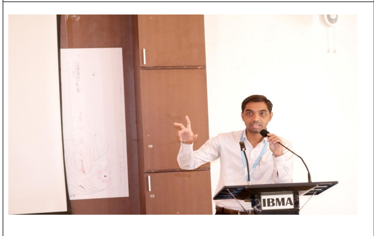
Case Writing and Communication Skills